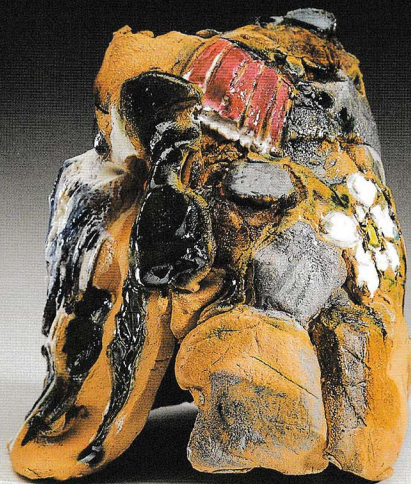
Toni Warburton. Rocky Place. 12 cm/ht.

such as Lucien Henri in the late 19th century and Eirene Mort, a practitioner and teacher, early in the 20th century, sought inspiration from the flora and fauna. The fervour of nationalist sentiment which surrounded the celebration of the bicentennial of European settlement in 1988, encouraged, for a moment, a rebirth of interest in specifically Australian motifs in the decorative arts. But few potters, silversmiths or cabinetmakers have been inspired by the landscape. Fewer still have been able to capture the qualities of the landscape in their work.