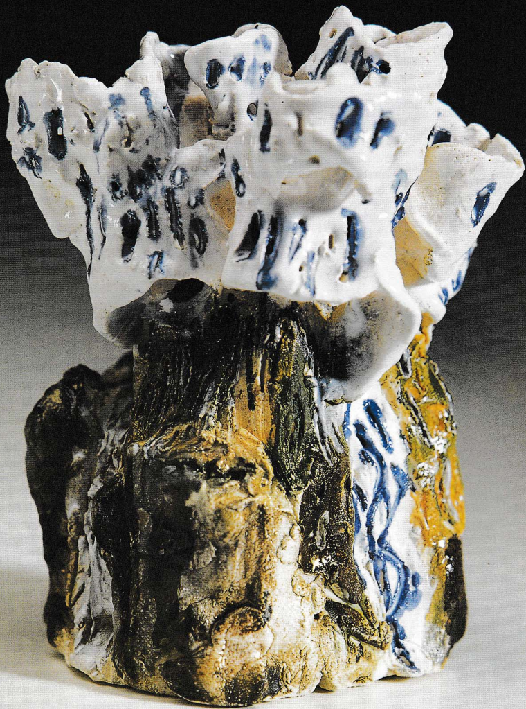
Toni Warburton. Cloud Place. 12 cm/h.