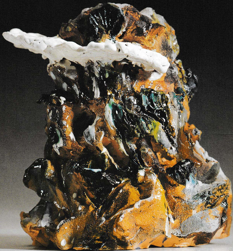
Toni Warburton. Mountain Rain . 22 cm/ft.

openings, which suggest an interior world, caves or volcanic fissures that allow insight into the mystery of their interiors and a hidden world. Others have no openings and insist on the quietest of contemplation. They invite the viewer to visually caress them, to