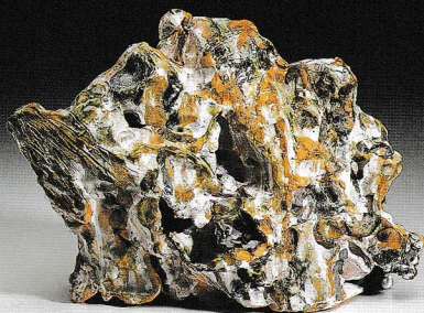
Toni Warburton. Unknown Place . 22 cm/lt.