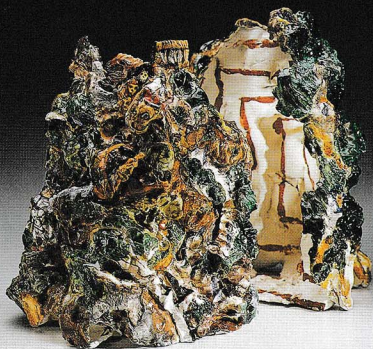
Toni Warburton. Pavagadh . 40 cm/h.