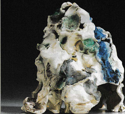
Toni Warburton. Old Place . 22 cm/h.